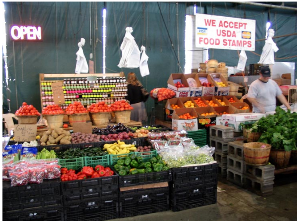
“I’ve never been a huge fan of vegetables, but now I can’t get enough”, says local Tom Long