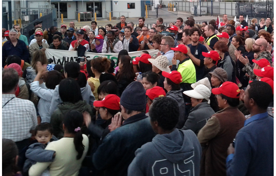
On Tuesday, the People Allied Against Intimidation rally drew hundreds throughout the evening.