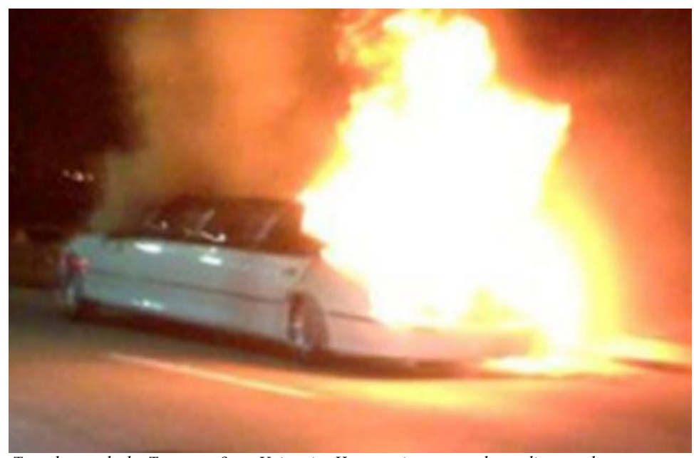
Tragedy struck the Tennessee State University Homecoming event when a limo used as a weapon against a homeless woman struck several children and burst into flame, rolling into Jefferson Street.