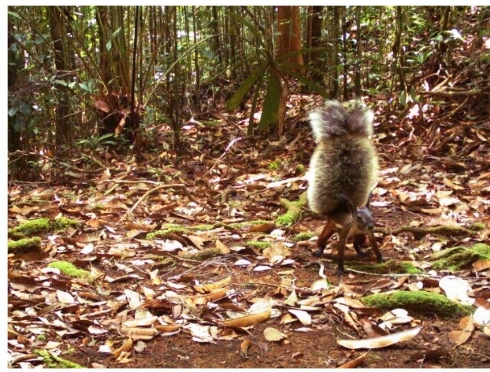
Believed to be a released exotic pet, a rare vampire squirrel has been spotted in Bells Bend Park. The squirrel, native to Borneo, is notable for having the world's fluffiest tail.