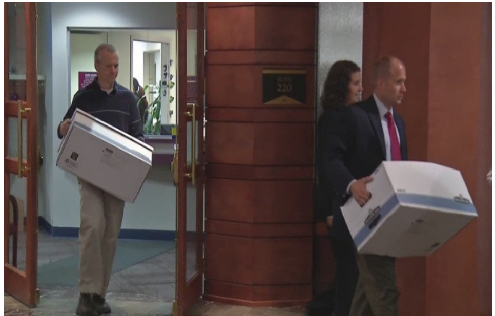
Locals returned to the park after an extended closure due to shocking damage done to the structure and the surrounding park.